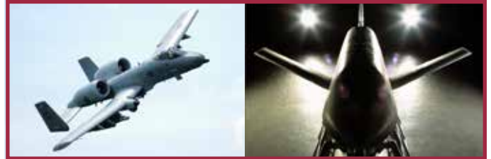
MANNED AND UNMANNED APPLICATIONS

As we refined our designs, we developed, validated and enhanced our extensive simulation capabilities as well. Through simulation, we can evaluate the environment of the target platform and determine the optimal configuration to meet operational requirements. Armed with this information and based on our scalable modules, we design and develop a GSTAR solution that is scaled to meet the performance, interface, packaging and cost requirements of the specific customer.